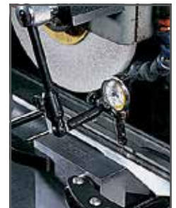
657A with 711LS Last Word Dial Test Indicator setting up workpiece on surface grinder.