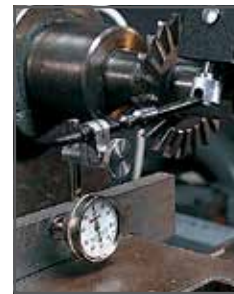
657A with 196B1 Universal Dial Indicator setting up workpiece on milling machine.